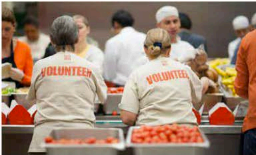
Volunteers in kitchen.