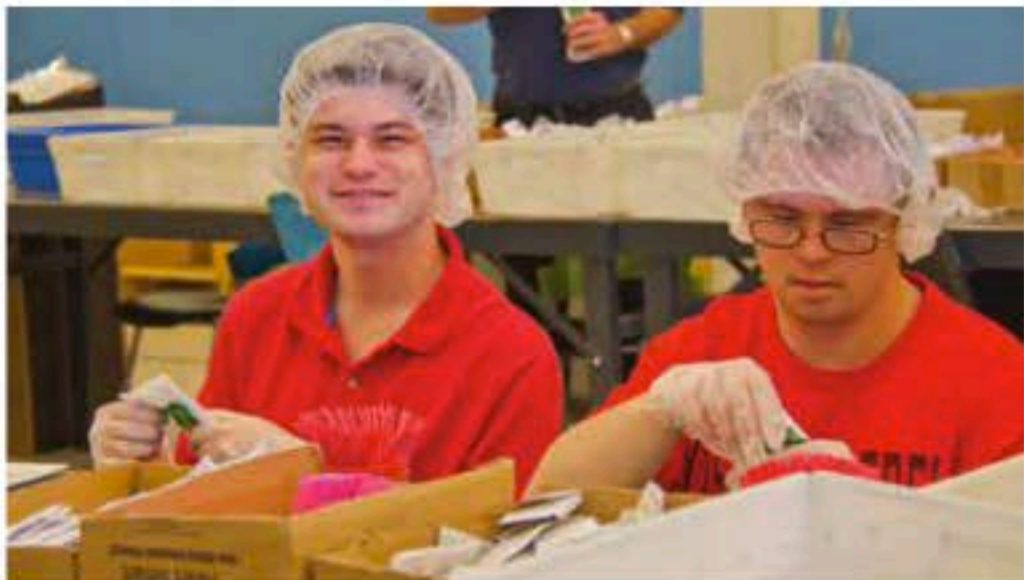
Opportunity Village's Assembly Authority workers assembling coffee condiment packets for its contract with Caesars Entertainment.